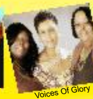
Voices Of Glory